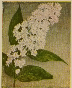
Nationally Known Pride of Rochester Deutzia

WAYNESBORO NURSERIES, Waynesboro, Virginia.